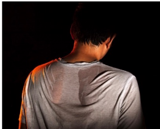
CHEN WEI, DISCO #1004, 2015, ARCHIVAL INKJET PRINT, 60 X 75 CM, EDITION OF 6 + 2 AP

"While they were once the realm of intellectuals and artists as a place to exchange ideas, nightclubs are no longer radical spaces," says Chen Wei of the scene in China. Such glorious past club cultures have been heavily documented in Europe and the USA, but that has never been the case in China, which is why Chen Wei has decided to fabricate his own visual archive of it through photography and installations.