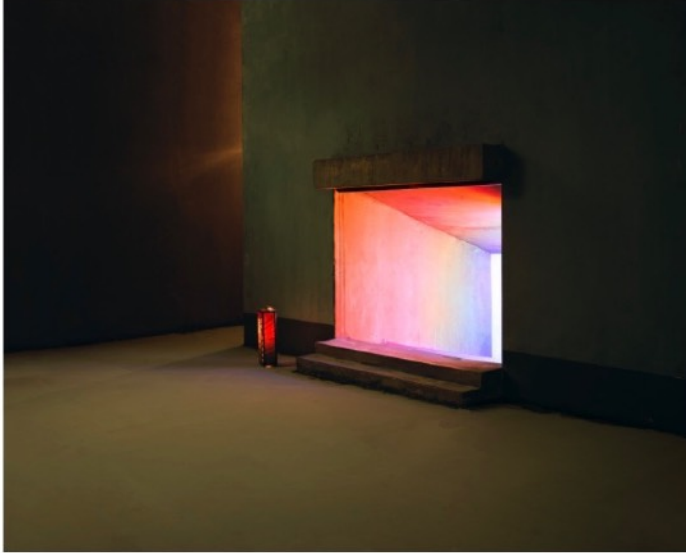
CHEN WEI, ENTRANCE, 2013, LIGHT BOX, 100 X 125 CM, IMAGE COURTESY CHEN WEI / LEO XU PROJECTS.

Sweaty dancers, alluring lights, smoke machines and trashed dancefloors are all depicted in the show that opens today at Melbourne's Centre for Contemporary Photography. The Beijing-based artist wanted to celebrate the club scene that emerged in the early 1990s as a space where people gathered to freely express themselves within the Communist country.