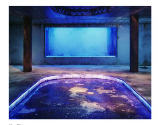
Chen Wei Dance Hall (Blueness), 2013