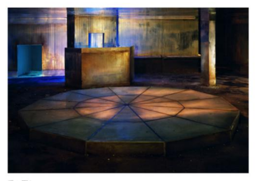
Chen Wei Dance Hall (Sober), 2013