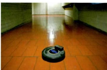
Anonymous, untitled, 2013, reprogrammed iRobot Roomba vacuum cleaner. Installation view, Lithuania/Cyprus pavilion, Venice.