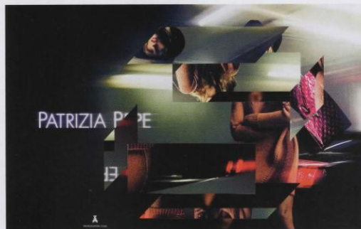
Patrizia Pepe 2012秋冬广告