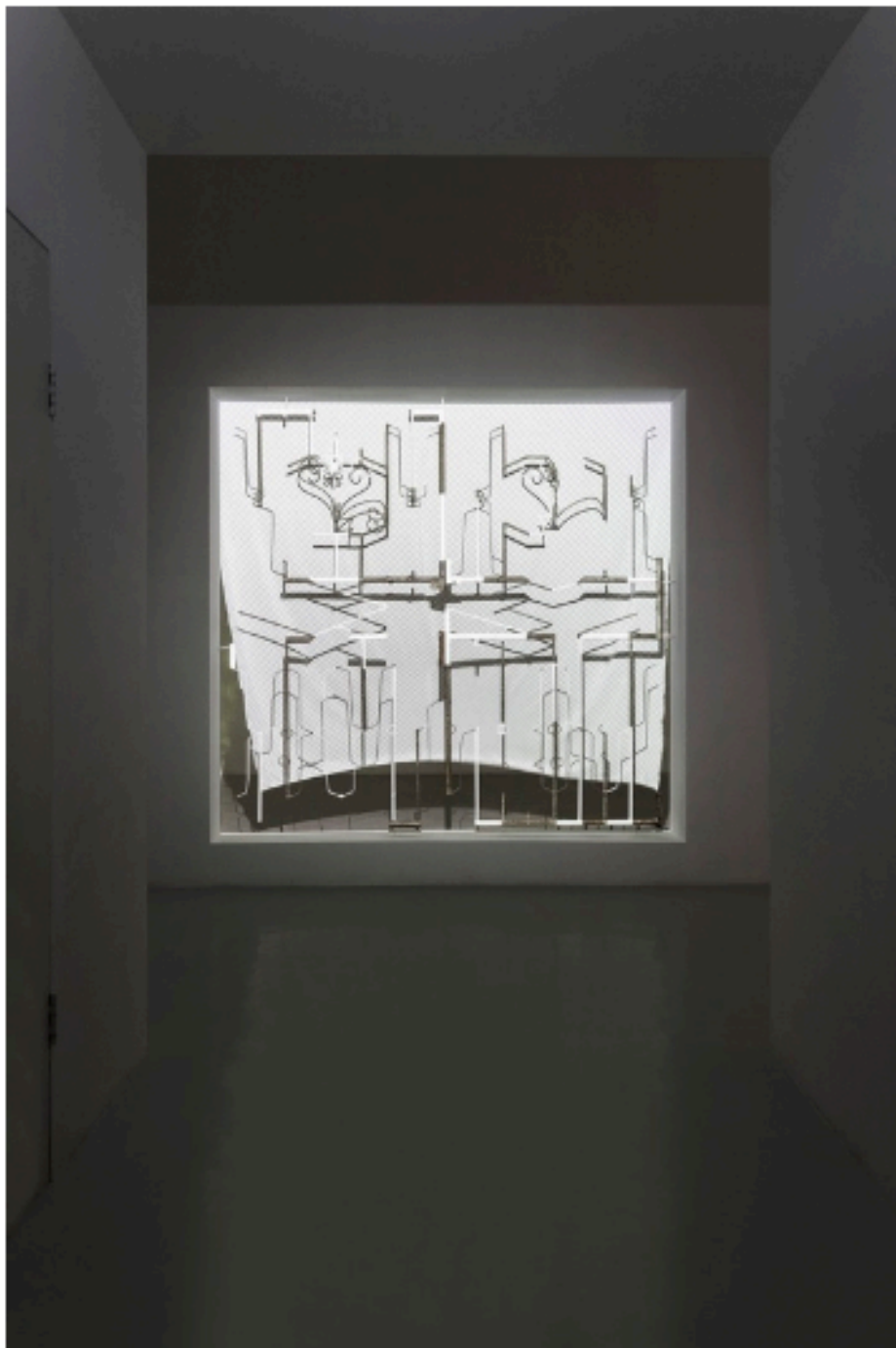
Liu Chuang, What is a Screen? , 2015.