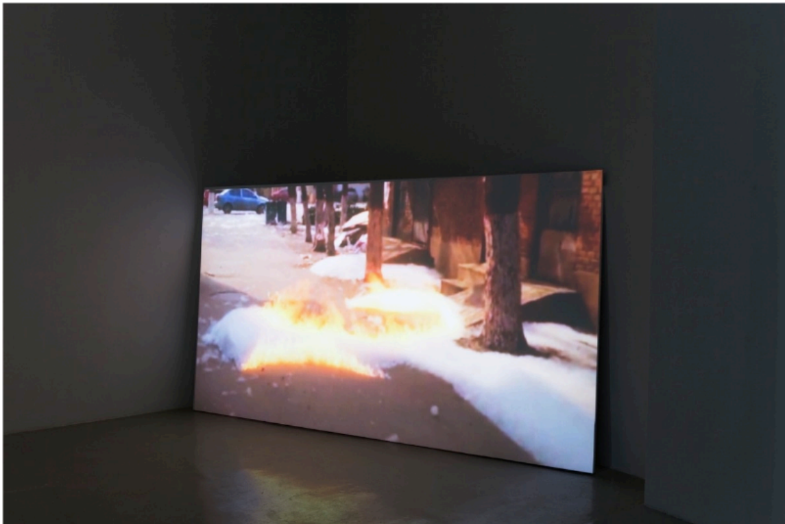
Liu Chuang, BBR1 (No.1 Blossom Bud Restrainer (2015) No. 2 , 2015.