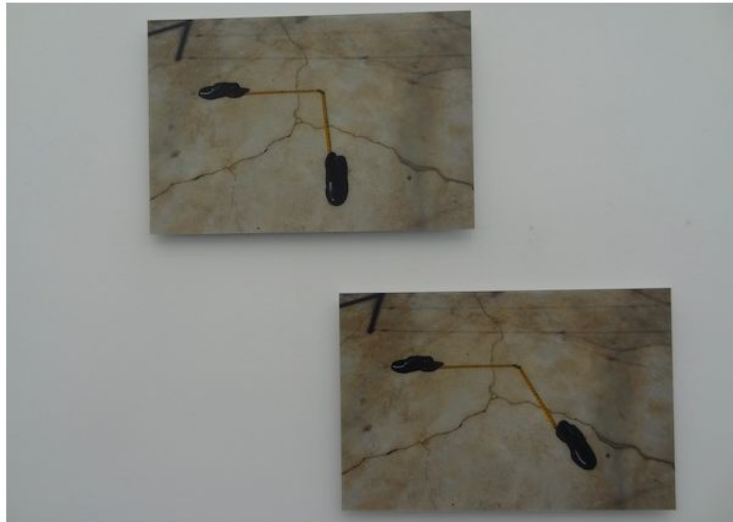
Above: Robin Rhode 's installation "Yard" (2012) at the L&M Arts booth consisted of a clock made of shoe photos. (Seen here , 9:25 and 9:30.)