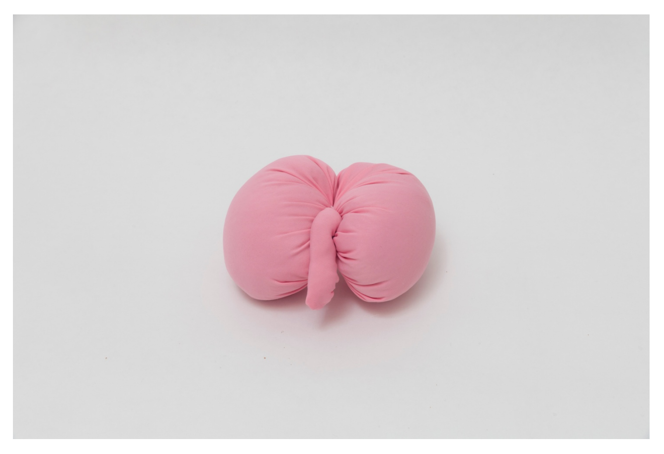
PIXY LIAO A Collection of Penises · Mr. Brain 2013 Stretchy fabric, pillow fillings, threads 12 x 10 x 5 cm