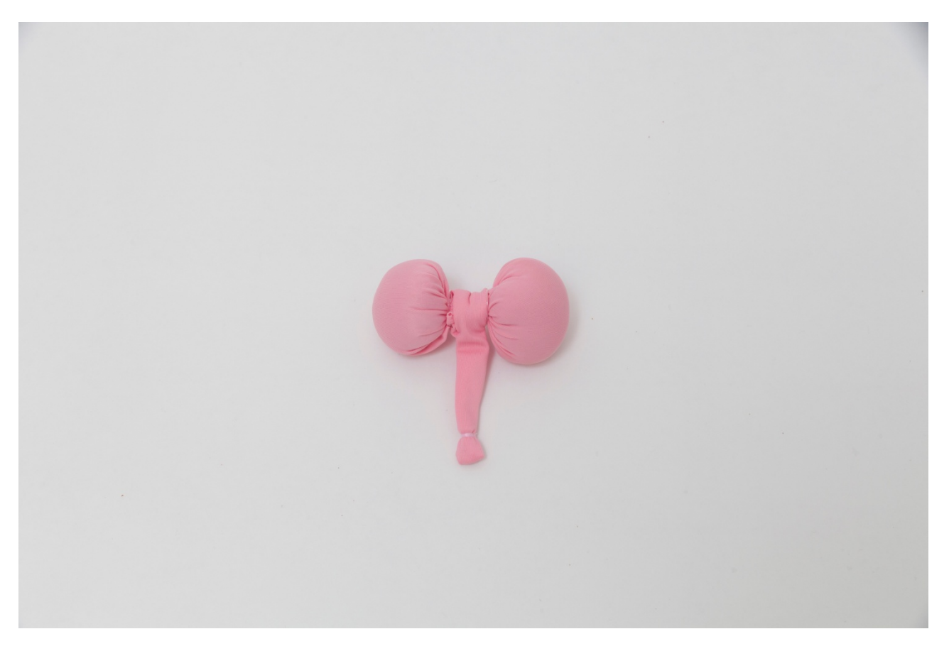
PIXY LIAO A Collection of Penises · Elephant 2013 Stretchy fabric, pillow fillings, threads 8 x 8 x 4 cm