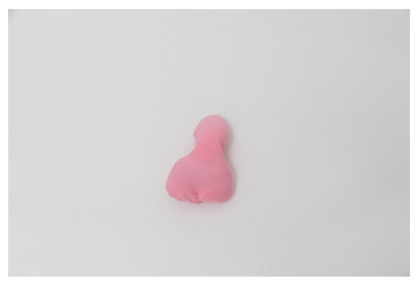
PIXY LIAO A Collection of Penises · Short Boy 2013 Stretchy fabric, pillow fillings, threads 7 x 9 x 4 cm