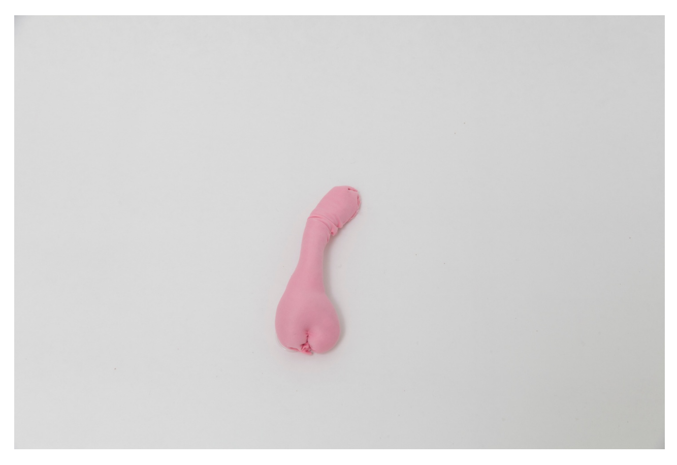
PIXY LIAO A Collection of Penises · Finger 2013 Stretchy fabric, pillow fillings, threads 4 x 11 x 2.5 cm