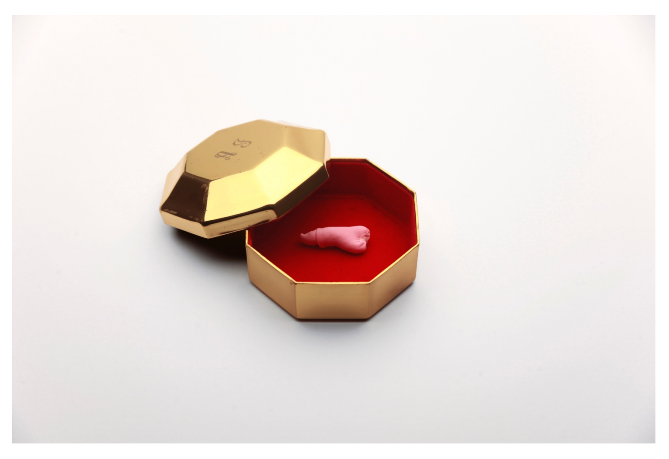
PIXY LIAO A Collection of Penises 2013 - present Stretchy fabric, pillow fillings, threads, vintage box Dimension variable