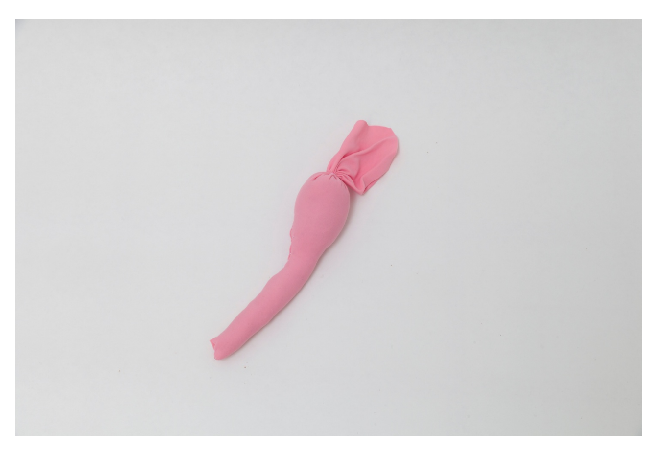
PIXY LIAO A Collection of Penises · Carrot 2013 Stretchy fabric, pillow fillings, threads 21 x 5 x 4 cm