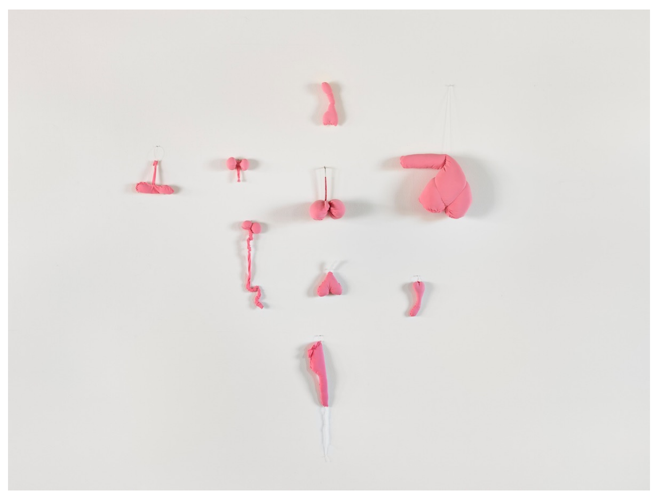
PIXY LIAO A Collection of Penises 2013 - present Stretchy fabric, pillow fillings, threads, vintage box Installation view at Pioneer Works Artist Residency Program, 2016