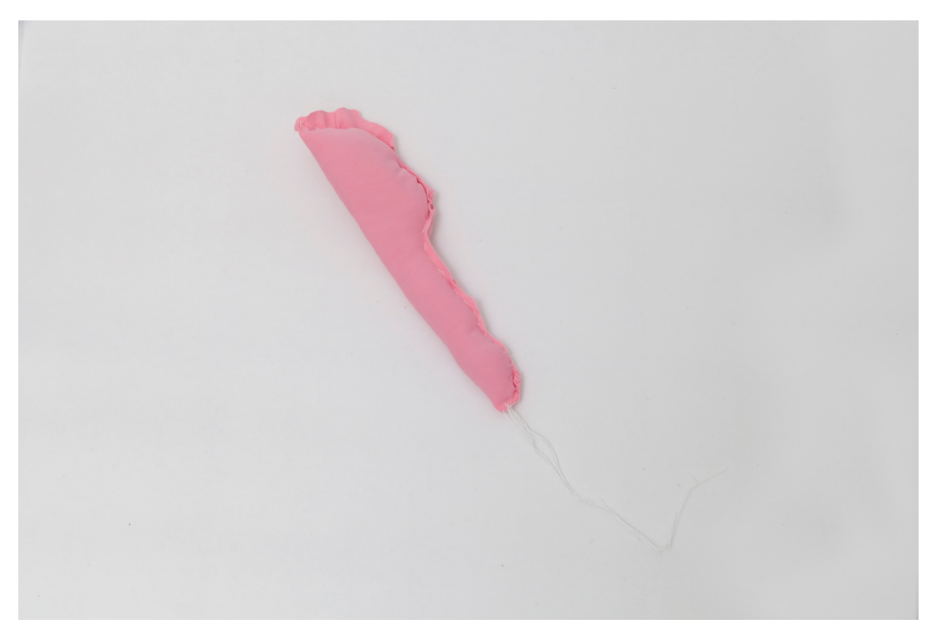
PIXY LIAO A Collection of Penises · Knife 2013 Stretchy fabric, pillow fillings, threads 22 x 6 x 3 cm