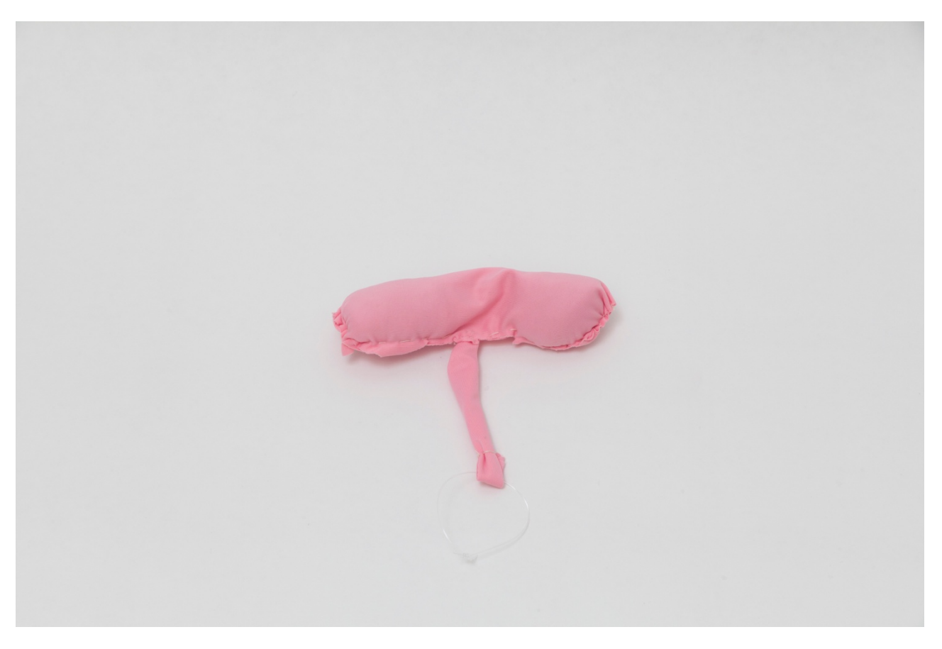
PIXY LIAO A Collection of Penises · Old Man 2013 Stretchy fabric, pillow fillings, threads 12 x 10 x 3 cm