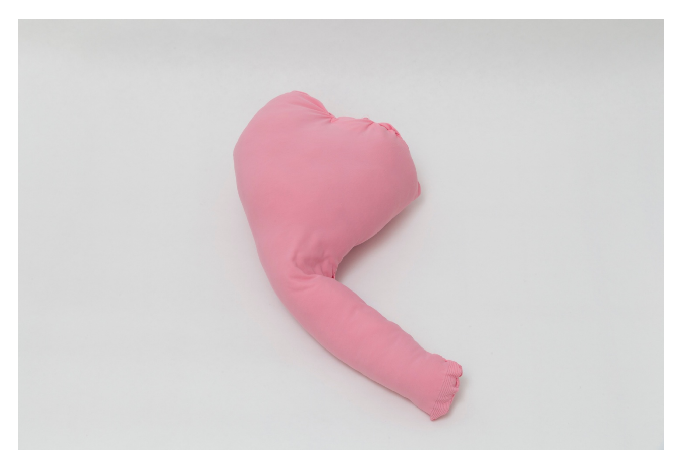
PIXY LIAO A Collection of Penises · Heart 2013 Stretchy fabric, pillow fillings, threads 18 x 36 x 7 cm