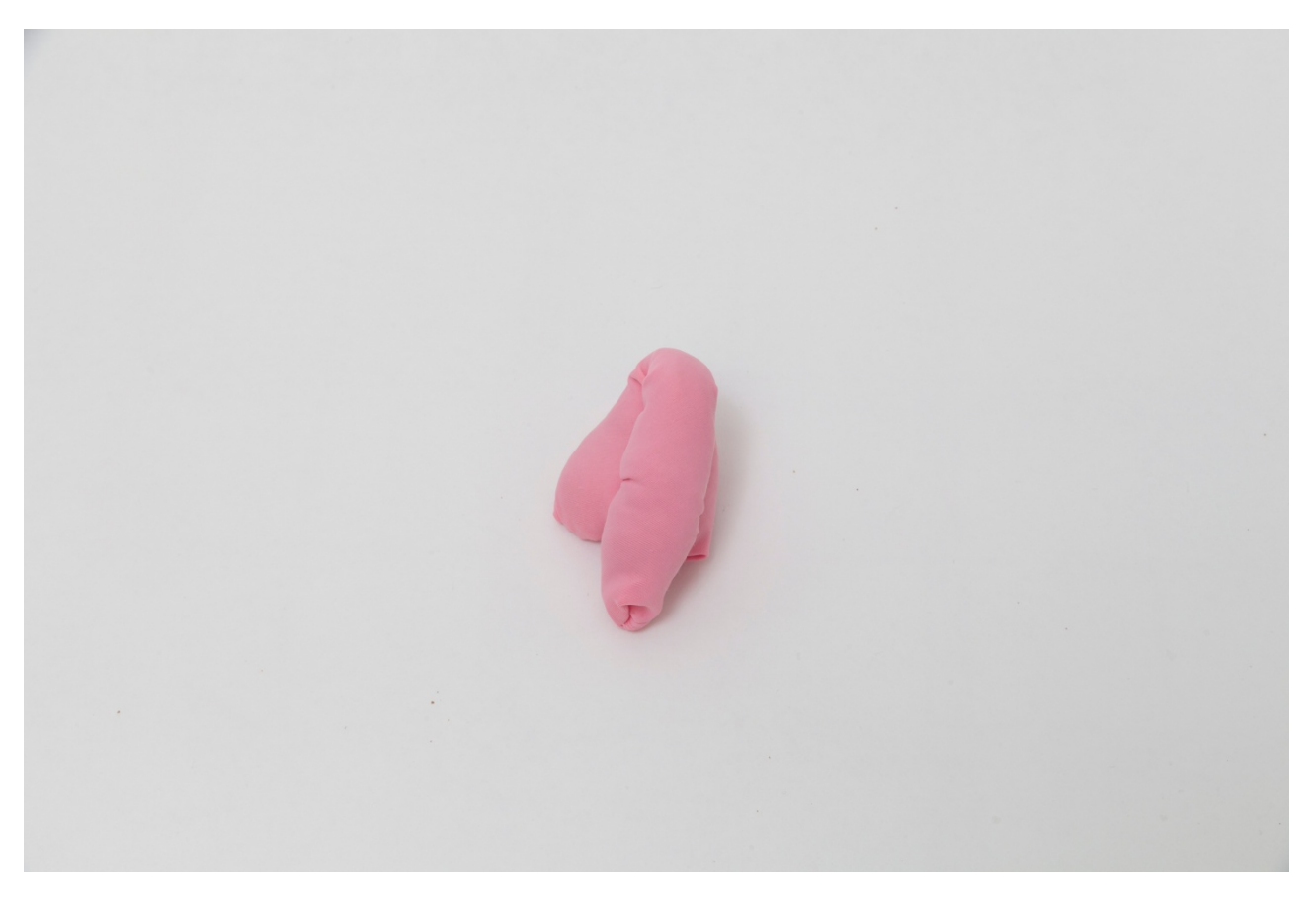
PIXY LIAO A Collection of Penises · Bend Over 2013 Stretchy fabric, pillow fillings, threads 5 x 8 x 5 cm