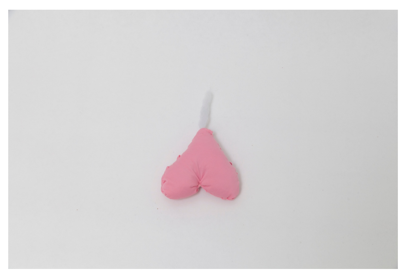
PIXY LIAO A Collection of Penises · Volcano of love 2013 Stretchy fabric, pillow fillings, threads 8 x 14 x 2.5 cm