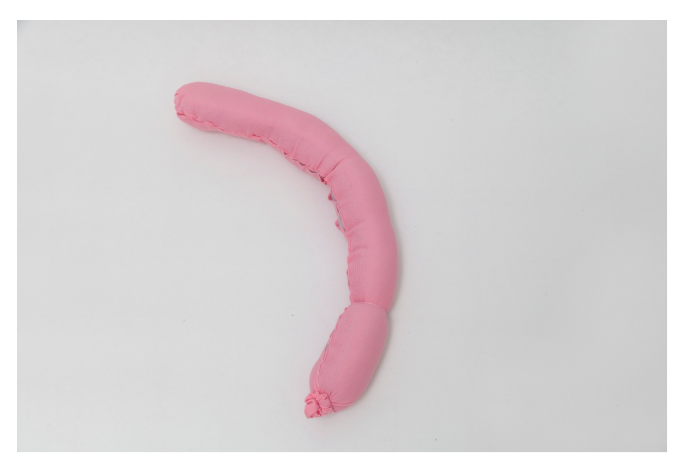
PIXY LIAO A Collection of Penises · Sausage 2013 Stretchy fabric, pillow fillings, threads 34 x 16 x 4 cm