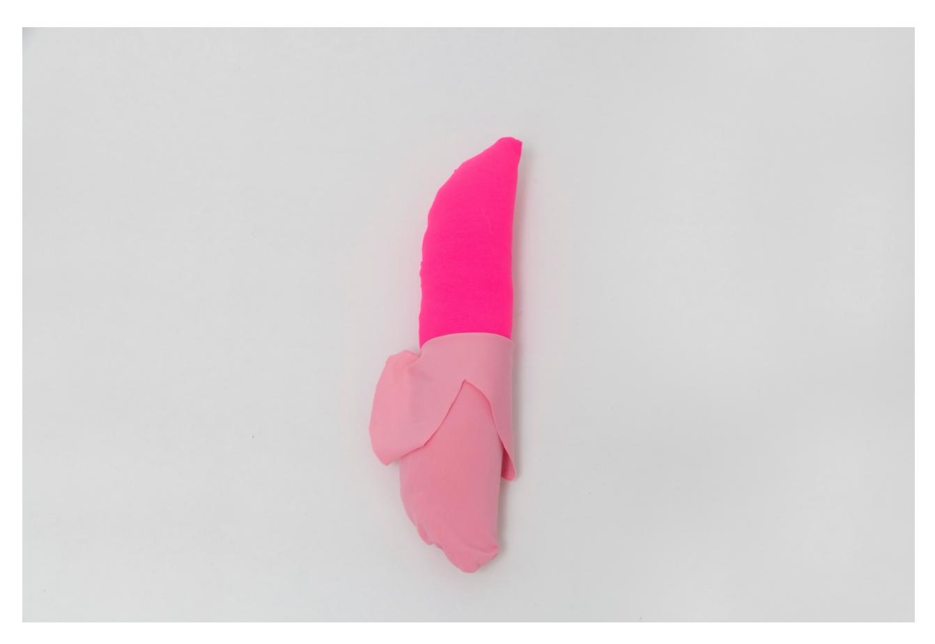
PIXY LIAO A Collection of Penises · Banana 2013 Stretchy fabric, pillow fillings, threads 22 x 8 x 4 cm