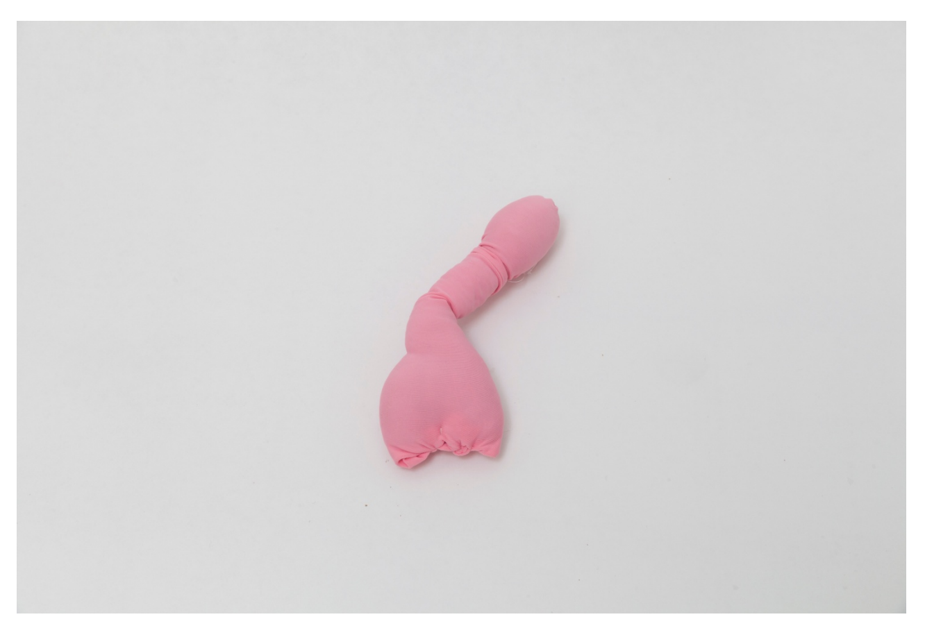
PIXY LIAO A Collection of Penises · Guitar 2013 Stretchy fabric, pillow fillings, threads 14 x 5 x 3 cm