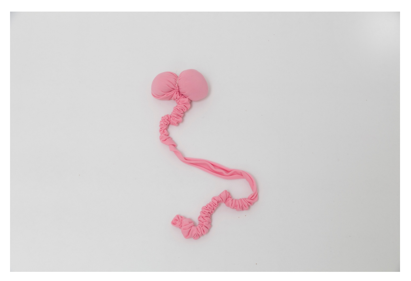
PIXY LIAO A Collection of Penises · Tortuous 2013 Stretchy fabric, pillow fillings, threads 7 x 30 x 3 cm