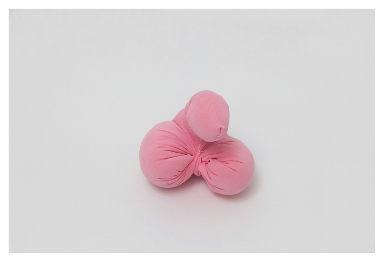
PIXY LIAO A Collection of Penises · Fat Boy 2016 Stretchy fabric, pillow fillings, threads 10 x 10 x 10 cm