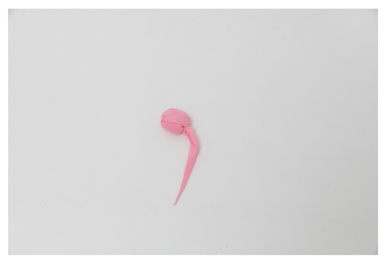
PIXY LIAO A Collection of Penises · Sperm 2013 Stretchy fabric, pillow fillings, threads 3 x 11 x 2 cm