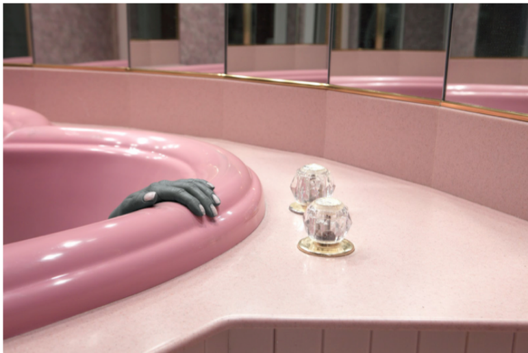
Juno Calypso, Seaweed Wrap , 2015. Archival pigment print, 40 x 60 in, edition of 5.

Melanie Willhide's featured project, Sleeping Beauties (The Box Under the Bed) , also tackles the relationship between lovers. Her works are forged antiques, intimate photos she's made authentically vintage-looking and well-loved, complete with scrawled messages and watermarks.