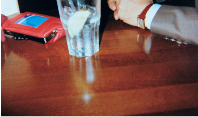
Natasha Caruana, Tiger Tiger, 2008-09. C-type photograph 16 x 20 in, edition of 5.