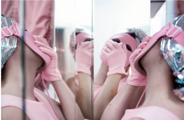
Juno Calypso, Massage Mask , 2015. Archival pigment print, 26 x 40 in, edition of 5.

For example, the photos in Pixy Liao's Experimental Relationship series focus on her relationship with her boyfriend and muse. "A male friend had asked me about why I had chosen a boyfriend who was, in his eyes, more like a girlfriend: younger, prettier and obedient," she writes, and in her photos her boyfriend is submissive, vulnerable, and frequently nude, as male artists have so often depicted their muses.