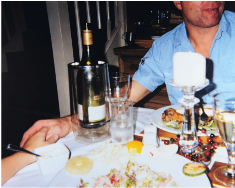
Natasha Caruana, The Barn, 2008-09. C-type photograph 16 x 20 in, edition of 5. Courtesy of Flowers Gallery

Melanie Willhide, Shallow Breath Thinking of You, 2007. C-print, 8 x 8 in, edition of 5. Courtesy of Flowers Gallery