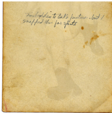
Melanie Willhide, For Spite, 2007. C-print, 8 x 8 in, edition of 5. Courtesy of Flowers Gallery