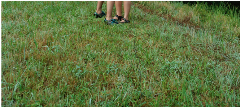
Pixy Yijun Liao, Get a firm grasp of your man , 2010. C-print, 20 x 16 in, edition of 5.

The Real Thing is presented at Flowers Gallery New York until February 27th. To learn more, click here (http://www.flowersgallery.com/exhibitions/view/the-real-thing) .